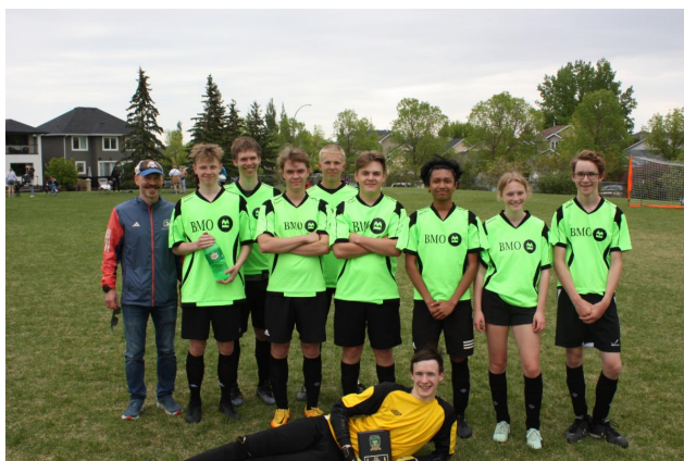
Wynyard Bears were named the Fair Play Award team in the Under 19 Mixed Division, as voted by the Match Officials at the completion of each round robin match