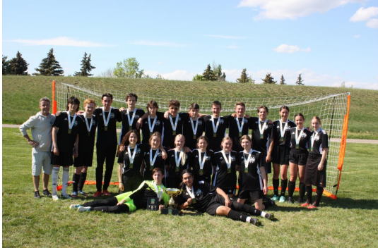
Waldheim was victorious in PK's over Kindersley in the Under 19 Mixed Division.