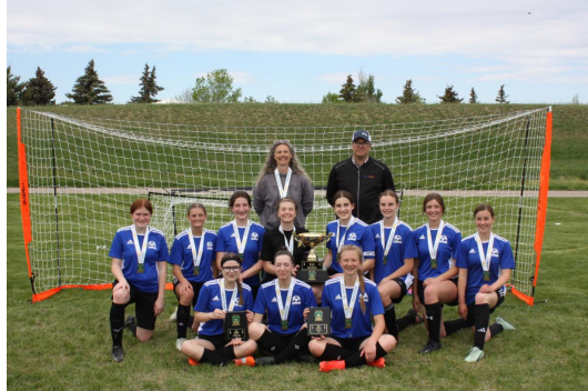
Prairie Central Soccer (Lanigan) defeated Valley United in the Under 17 Female Division.