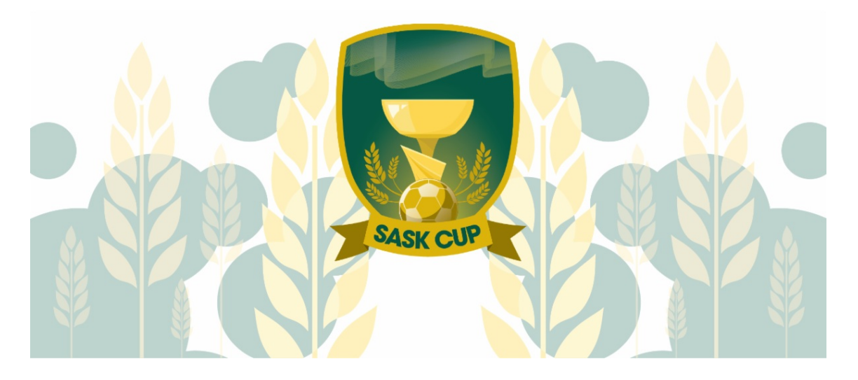
Sask Cup Results - Saskatoon, February 22-25