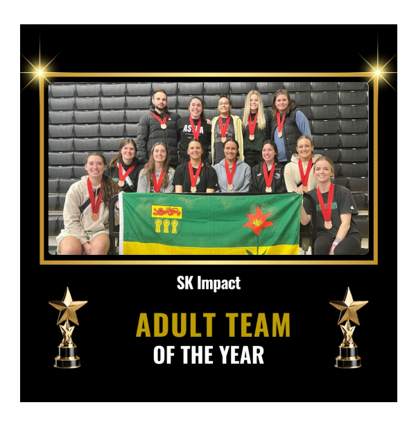
Adult Team of the Year SK Impact