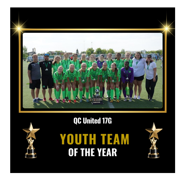
Youth Team of the Year QC United 17G