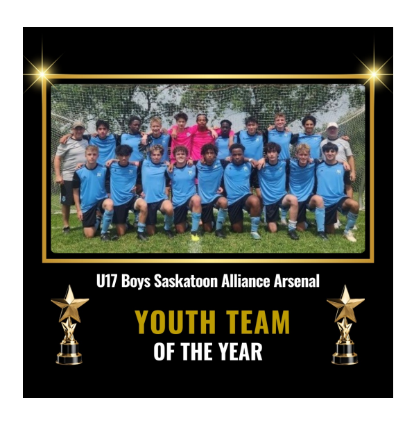
Youth Team of the Year U17 Boys Saskatoon Alliance Arsenal